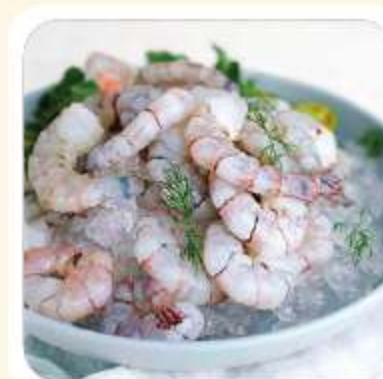
Peeled & Deveined (P&D)

Peeled & Deveined (P&D) Premium cleaned shrimp with vein removed. High-value product for hotels, restaurants & retail.