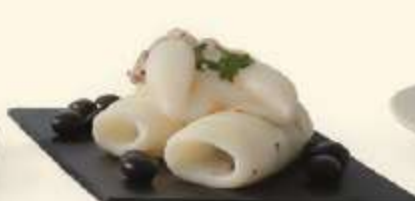
Whole Cleaned Squid