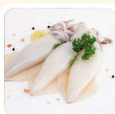
Whole Cleaned Squid

Whole Cleaned Squid Fully cleaned, tube & tentacles intact. Available IQF or block. Widely used in calamari, stir-fry & grilled dishes globally.