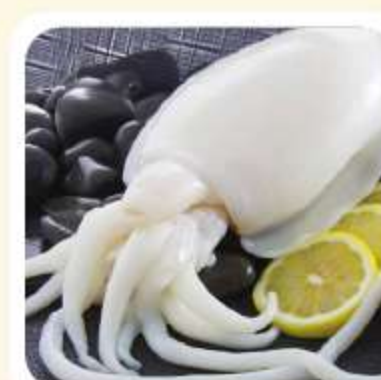
Whole Cleaned Squid