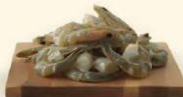
Head On Shell On Peeled & Deveined