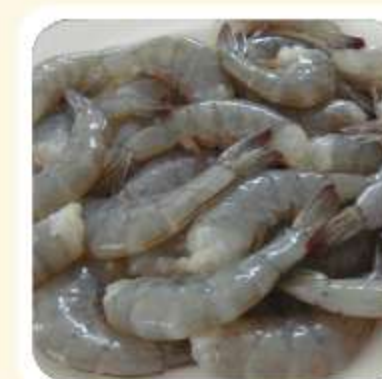
Headless Shell On / Eazypeel

Headless Shell On / Eazypeel Shell-on presentation with easy peel feature. Great for BBQ, grilling, and prawns-on-shell dishes.