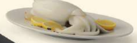
Whole Cleaned Cuttlefish