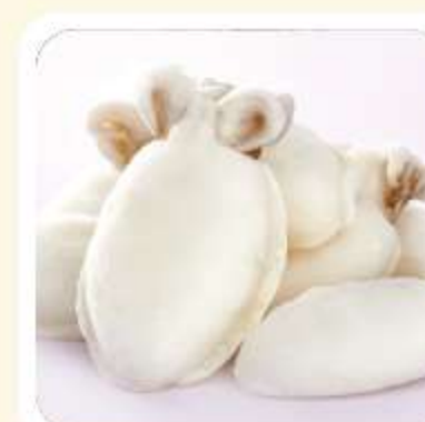
Whole Cleaned Cuttlefish

Whole Cleaned Cuttlefish Cleaned cuttlefish ideal for Asian cuisine and Mediterranean dishes. Available in various size grades.