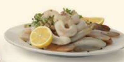
Headless Shell On / Eazypeel